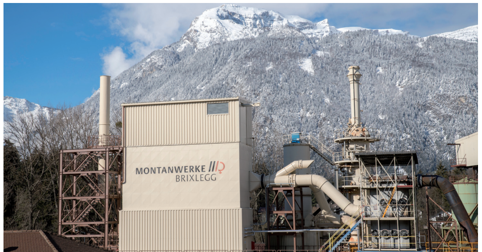
Also in the mining works in Brixlegg / Austria Scheuch proved itself as a competent problem solver with a modern kiln dedusting.